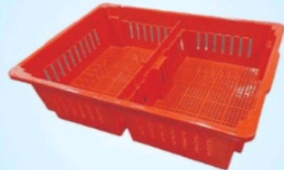
CH-2 (Chick Transport Crate) 2 Box