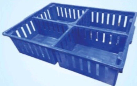
CH-3 (Chick Transport Crate) 4 Box