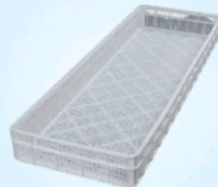
CH-4 (Eggs Transport Crate)