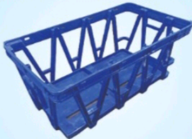
CH-1 (Eggs Transport Crate)